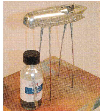
Al-clad 'white aluminium' chosen for main paint finish

Now to paint the body - but what colour? Photos on Tin Wizard's site show a bare metal finish while those on GPM's site show it white, which it transpires is a speed record version. Googling "SSKL streamliner" showed both, too. Then I googled "1932 Avus race" and found quite a few very clear black and white photos. The most useful showed the car alongside what was obviously a "Bugatti Blue" Type 35 and just ahead of an apparently white stock SSKL: it was a different shade than either. I sent the photo to a friend who spent a fair part of his USAF career as a photo analyst and he came back with "bare aluminium or a light-coloured metal", so I airbrushed on a couple of coats of Al-clad II "White Aluminium".