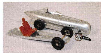
Ready for final assembly. Note - exhaust painted a dull 'iron'

Assembly is very simple - the rear wheels and dash fit into the body (don't forget the lever-action shocks) and the fronts attach to the chassis, then the two are mated with a bit of CA glue. Only one set of decals is used; mine were positioned as Avus photos showed. I scraped and polished the hood (OK, bonnet) latches and centre hinge for a bit of contrast, and photos clearly show that the exhaust pipe is not chrome-plated; I gave it a coat of Humbrol "Iron". I'd originally painted the dash black with the recessed instrument faces white, but just before installing it I found some black-on-clear instrument faces in my decal box and added those, which gave more life to the dash.