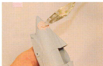
Joint for tail housing filled and re-scribed

After the usual warm water/detergent soak and scrub I glued the tailcone to the body and gave all the white-metal parts a coat of primer. That revealed a couple of pinholes under the nose and a rather large seam at the tailcone joint. There is a panel line there, but not that big so I filled the seam with putty, sanded that smooth, re-primed the area, and then re-scribed the panel line.