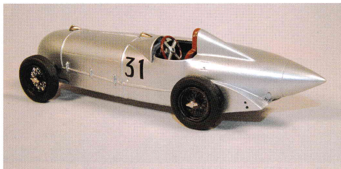
The completed kit (TIN430360) finished as von Brauchitsch's 1932 Avus winner

While primer and paint were drying, I tackled the wire wheels, a job I usually botch badly. Years ago I made a cone-bending tool by sanding a wooden knob to a conical shape and inserting a toothpick in the centre so I could bend a set of spokes to a slight conical shape before dropping them into the wheel halves. Much to my surprise, Tin Wizard's wheels worked perfectly.