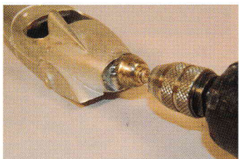
Dremel used to clean joint for separate tail housing

tom of the body. I did have to clean the inside of the tail cone housing a bit with a Dremel Tool to get that to fit, but cleanup took less than 20 minutes.