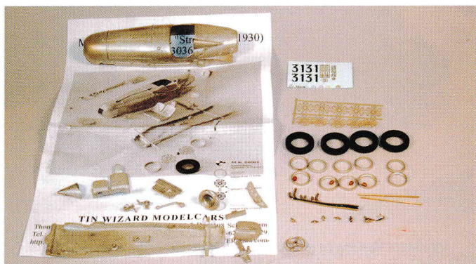
Tin Wizard kit TINM430360 contains 52 parts, 20 of which are for the wheels.

My finished model matches photos very nicely, wheelbase is right on 1/43 scale, and when the axles are cut to 1/37 inches to give a 1/43 scale track, they also fit perfectly. This is a rather simple kit by current standards and I have no qualms about recommending it to a novice builder - or an experienced one who'd like a break from more complex kits! But if Tin Wizard really wants to sell kits, especially to less experienced modellers, they really need better instructions.